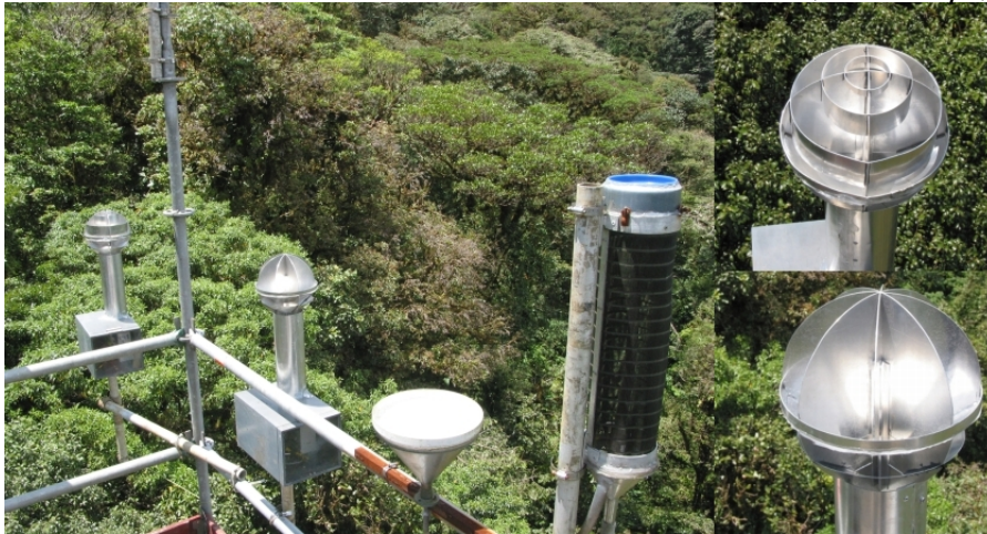
Figure 1: Comparative rain-gauge experiment.

al. 2006b). The use of inclination of precipitation ( \alpha ) rather than wind speed u allowed the derivation of a more generally applicable expression for montane terrain as \alpha incorporates the influence of u (both up- and downslope) and turbulence on rain droplets and therefore their susceptibility to being deflected. Significant corrections were obtained only for small droplets with this model, thereby avoiding the large corrections normally obtained for large droplets with models based on u . The precipitation total measured by the conventional gauge for the experiment amounted to 179 mm vs. 210 mm after correction for wind-loss (17.3%). Total HP caught by the potential precipitation gauge was 615mm. Total P_{pot} was then derived from \alpha , P and HP as 652 mm and 660 mm before and after correction of P for wind-loss. The small difference reflects the dominance of events with \alpha > 70^\circ (79% of P_{pot} ).